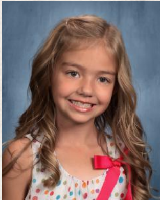
Paige 2nd Grade