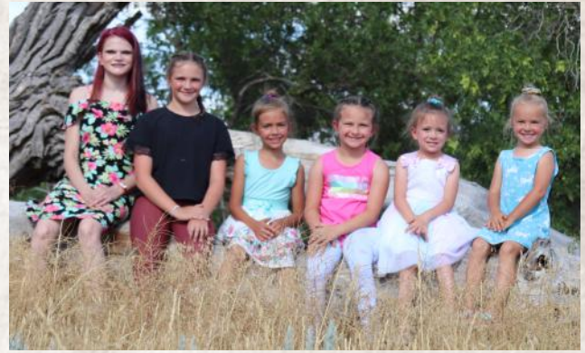
Granddaughters are a blessing we count twice!

We are so thankful for all of our customers!