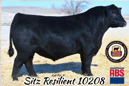
Sitz Resilient 10208

Sitz Resilient 10208 offers elite Foot Score and Hair Shedding EPDs, is in the top 5% $Maternal index, and posted an individual PAP score of 37. He is wide based, deep bodied and free moving.