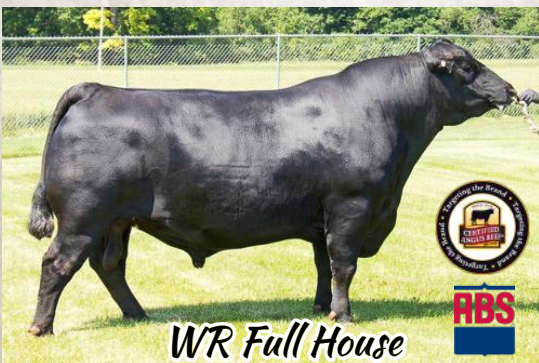
WR Full House

R76 is a heifer bull deluxe. He is a breed leader, in the top 1%, for Heifer Pregnancy, top 3% for Birth Weight, and top 5% for $C.